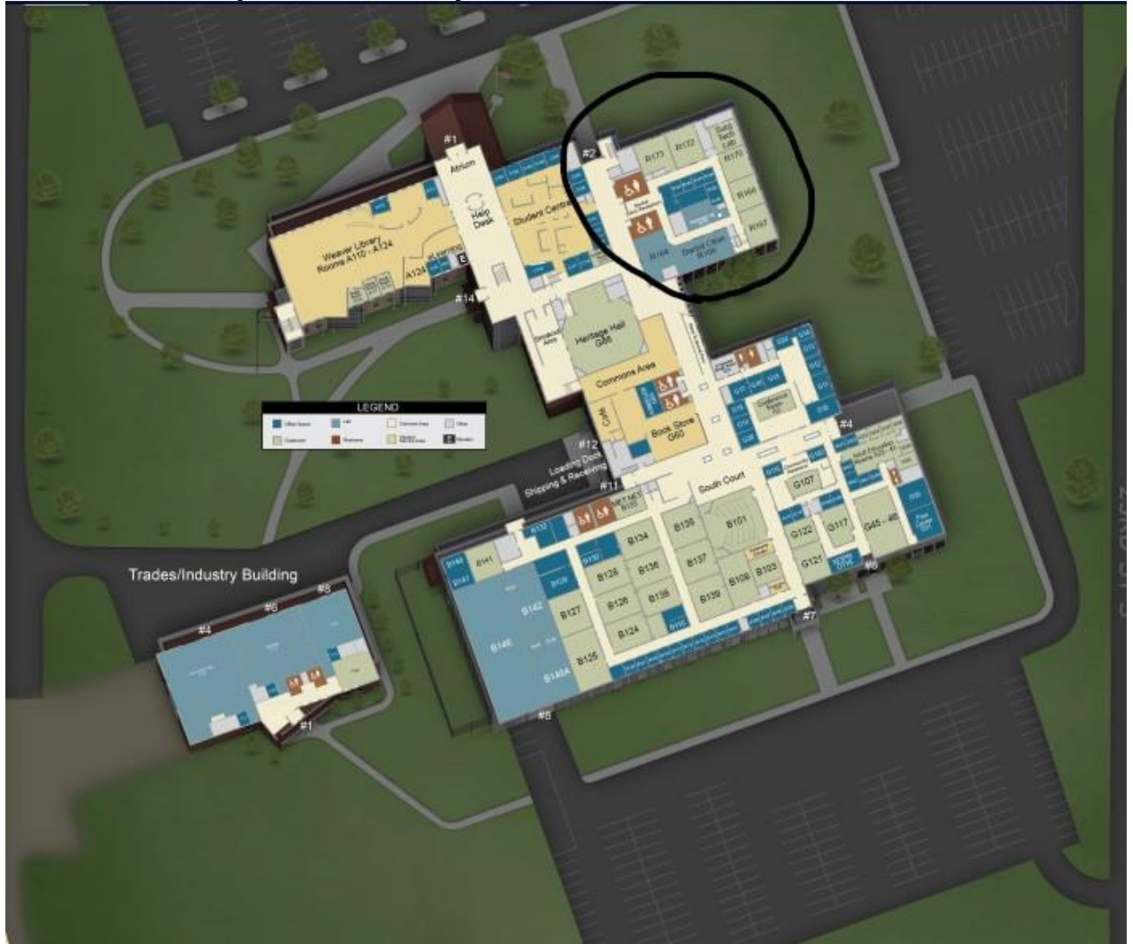
Great Falls College MSU