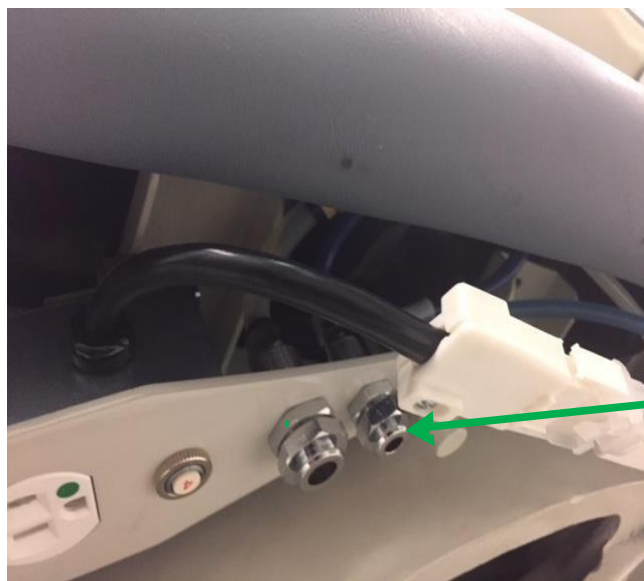
the smaller connector nearest the grey knob.

Water connection for ultrasonic scaler under right side of chair. Power outlet also in this area. Note this is