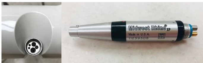
Handpiece (Sample only- not available for rent)

A. Handpiece and Prophy Angle Hookups: The delivery systems are Midmark brand and equipped to use RQ-04 Roto-Quick couplers (4 hole) slow speed handpieces. Each Candidate should provide his/her own slow speed handpiece.