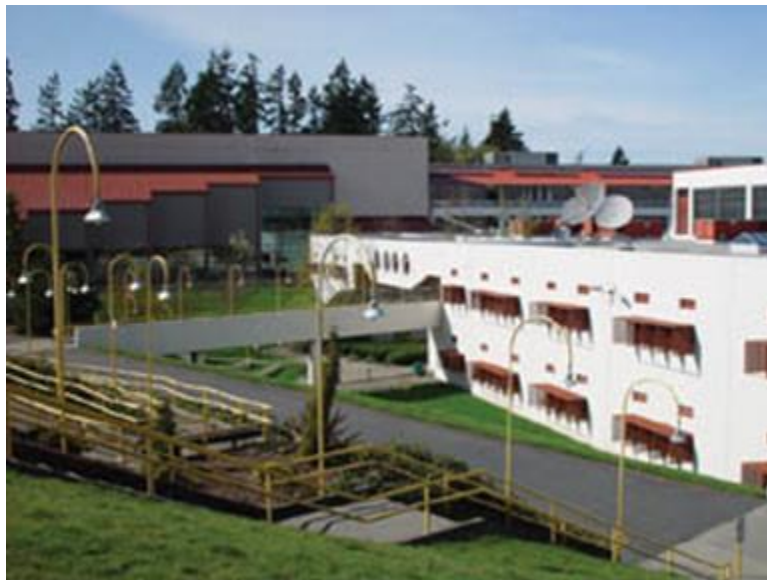
White building, east building. Allied health building entrance is off to the right of this photo.

The dental clinic is located in the east building in E106. The east building is the two-story U-shaped building on the map. The dental clinic is located in the lower right side of the U shape. In the area that state entrance by the allied health building. The fastest route to the clinic is entering the east campus entrance, park near the allied health building. You will enter on the third floor, take the elevator down to the first floor. Take a right out of the elevator, then an immediate right. Once you pass the stairs, the dental clinic entrance is through the double doors on your left.