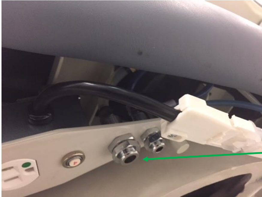
Water connection for ultrasonic scaler under right side of chair. Power outlet also in this area.