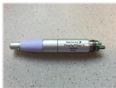
Handpiece (Sample only – not available for rent)