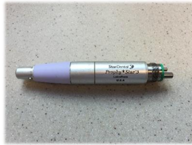
1 Handpiece (sample only - not available for rent)