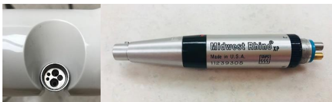
Handpiece (Sample only- not available for rent)

A. Handpiece and Prophy Angle Hookups: The delivery systems are Midmark brand and equipped to use RQ-04 Roto-Quick couplers (4 hole) slow speed handpieces. Each Candidate should provide his/her own slow speed handpiece.