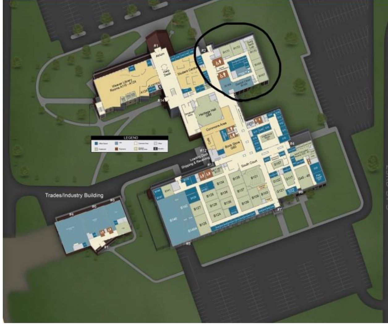
Great Falls College MSU

Campus Map: From Great Falls International Airport, take I-15 N from Terminal Dr. and Airport Dr., Take MT-200 E/US-89 S to 10<sup>th</sup> St S in Great Falls, Continue on 10<sup>th</sup> until 20<sup>th</sup> St. S. Take a right onto 20<sup>th</sup> St. S. Then take a left onto 16<sup>th</sup> Ave S. Continue on 16<sup>th</sup> Ave S. until you have reached your destination.