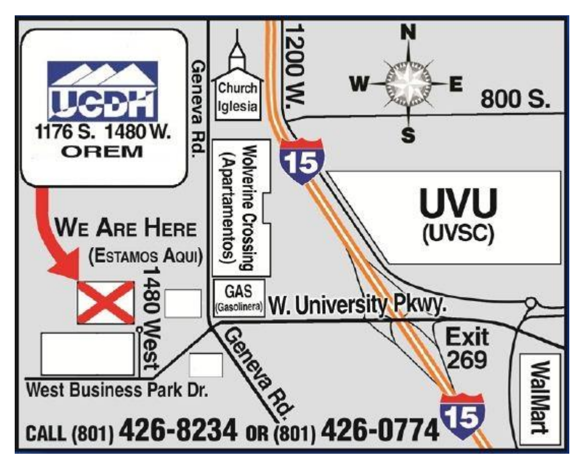
Close up map from Exit 269 in Orem Utah.

Heading northbound on Interstate Highway 15 (I-15) take the University Parkway Exit #269 and veer to the left. At the top of the hill, turn left onto University Parkway & go down the hill to the traffic light (University Parkway and Geneva Road). Drive straight ahead down a slight hill about one block (University Parkway becomes W. Business Park Dr.). Turn right on 1480 West. The Utah College of Dental Hygiene is located on the left at the end of the block.