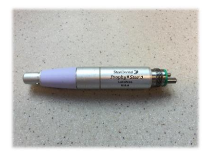
1 Handpiece (sample only - not available for rent

B. Sonic/Ultrasonic Devices: WREB allows the usage of sonic/ultrasonic devices as an adjunct to calculus removal. Each dental unit has a Dentsply